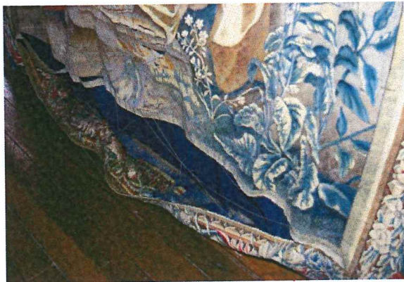
Small Drawing Room Arachne tapestry split at lower edge before conservation