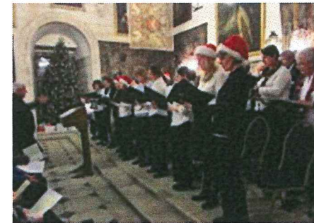
Christmas Concert in the Great Hall