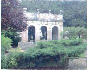
The Horse Temple

pronounced Batterst after Batters, the original family home in the Duchy of Luneberg), near Battle, in Sussex.