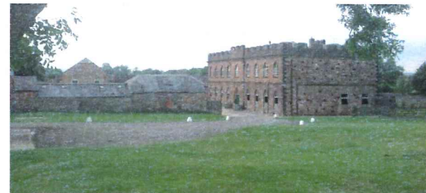
The Berkeley Hunt stables and kennels