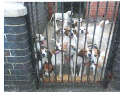
Friendly Beagles at the Kennels