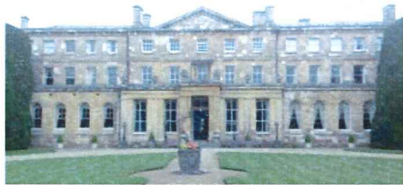
The East (entrance) front of Cirencester Park

starts at the tower of the parish church, passes through the centre of the house (the Great Hall of the Tudor house) and continues in a straight line to Sapperton, five miles distant. The second son of the first Earl was created Baron Apsley. He built Apsley House in London, later sold to the Duke of Wellington, a friend of the 3 rd Earl. Many generations of the family took an active part in national life.