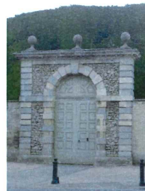
The entrance to Cirencester Park, through the gates and the 40-foot yew hedge