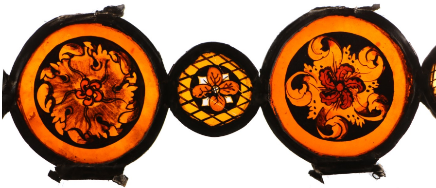
A example of Webb's flower design (the painted quatrefoil on a hatched ground in the centre), flanked by roundels of possibly earlier glass.

Philip Webb, the notable Arts and Crafts architect and business partner of William Morris, was the next designer to leave his mark on the Great Hall windows. In 1874 Webb wrote to Lady Fitzhardinge, at Cranford House, proposing to retain Shrapnell's general layout of shields in the upper light and the hexagonal shape of the panes in the lower light but " to glaze the lower portion of each light with a flowered quarry and coloured border, and the upper