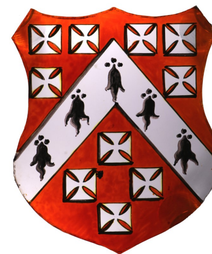
Left: Webb's flower design on a star shaped pane. Right: Another coat of arms visible in Shrapnell's design.

flower design. There are also many heraldic shields and their corresponding scrolls, painted with the names of the families that the shields represent, these from Shrapnell's time as chief designer. Although the scrolls are not actually visible in the photographs of the windows, they were described in F. Were's Heraldic Notes of the Spring Excursion to Berkeley Castle , published in the 1905 edition of the Bristol and Gloucestershire Archaeological Society Transactions. From that, we can assume that the light through the windows had bleached the detail from the image. Several complete panels, still in their lead, were found. These, along with other pieces of glass painted with a 'sunburst' design, are believed to come from windows in rooms other than the Great Hall, but are presumably still within the 8 th Earl's renovation period. Some of the glass dates from Webb's era, some from Shrapnell's, and some from an earlier date.