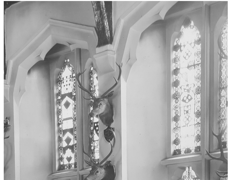
Detail of a photograph of the Great Hall c. 1900, showing the window panels as redesigned by Philip Webb.

When Morris visited Berkeley with Webb in July 1876, after appraising the sample window, the two men decided that this design needed to be changed and the upper lights should have a similar border to the lower lights to " bring the whole together ". These improvements were made and Webb's design fees of £59 were settled in May 1877. There are several photographs that show the Great Hall circa 1900 and it is believed these photographs depict the Webb/Morris design; the flowing grisaille border from the upper light being removed and the same flowered design being used in the upper light.