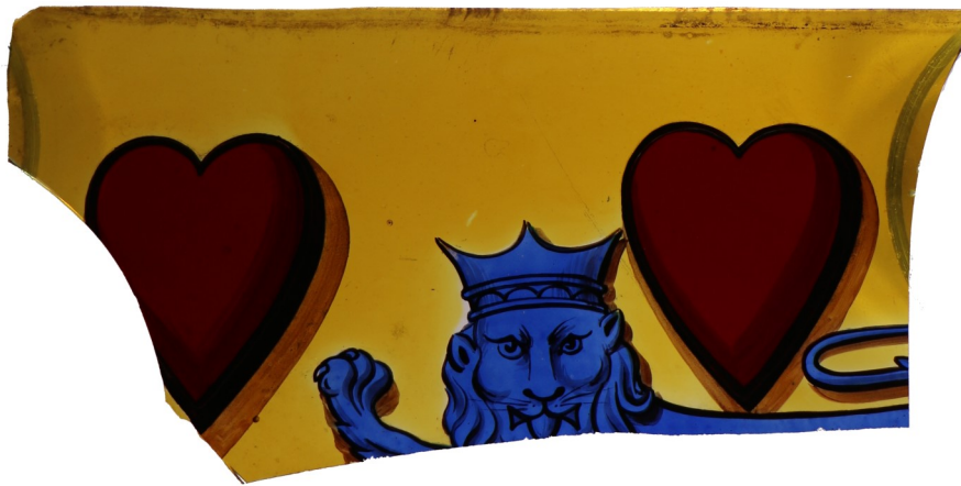
A fragment of the Arms of the Danish Royal Family. (The Berkeleys were believed to be descended from the Kings of Denmark).

In 2021 a large collection of stained glass pieces was discovered in The Old Granary at the Berkeley Estate Yard: much of this is believed to have been saved when the present Great Hall windows were inserted in the 1920s. Many pieces of the glass are painted in Webb's