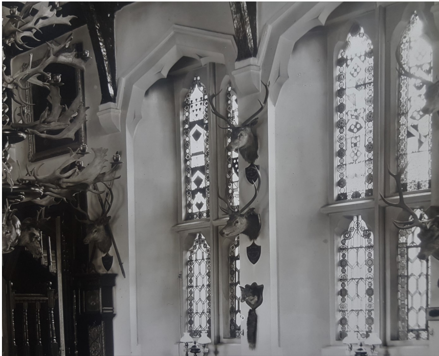
A C19 photograph of the Great Hall windows, with the panels (at the top) shown in colour in the picture on page 11.