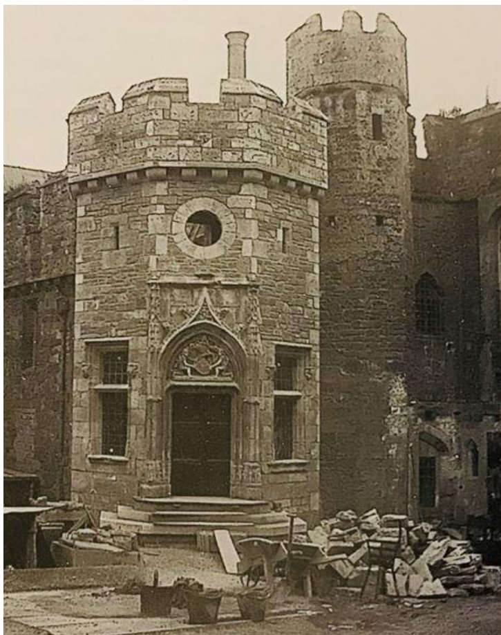
Building the new porch in the Inner Bailey (see pages 12-15).