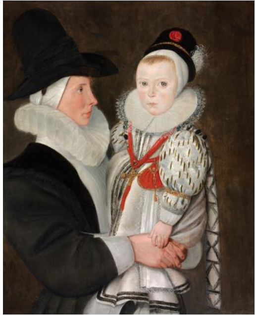
Elizabeth as a young child.

Despite Henry VIII's overriding ambition to provide a son and a lasting dynasty, which crushed Anne, Elizabeth's death in 1603 brought an end to the Welsh House of Tudor and ushered in the Scottish House of Stuart.