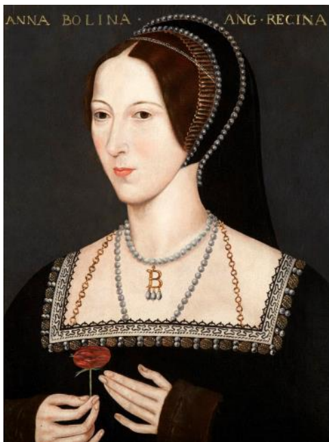
Right: Anne Boleyn, Queen Consort of England

Anne's sister, Mary Boleyn married William Carey and a portrait of their son, Henry (who may have been a son of the King), is on the wooden screen in the Great Hall of Berkeley Castle.