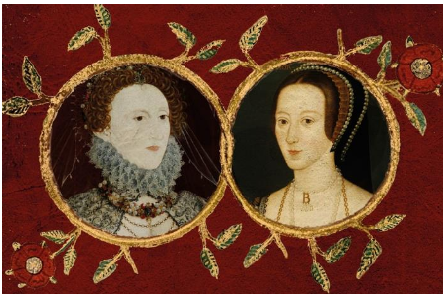
Elizabeth and Anne, from the cover of Tracy Borman's book.

Anne was a descendant of Edward I and the second daughter of Thomas Boleyn. She was born in Blickling Hall, the family home in Norfolk. She appears in records