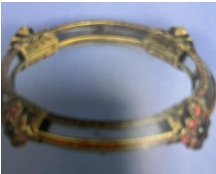
The Hunsdon Bracelet

I would like to let you know about the Tudor Royal Jewels that have come to the family and have been on loan to the Victoria and Albert Museum. They are about to go to an exhibition in Paris entitled 'A Taste for the Renaissance: A Dialogue Between Collections'. This is